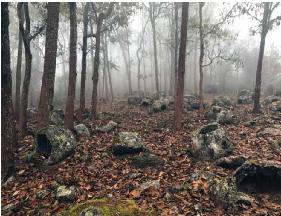
LEFT Site 52, on a misty morning. It lies in a remote upland region, a setting more representative of the majority of the Laos jar placements than those at Ban Hai Hin.