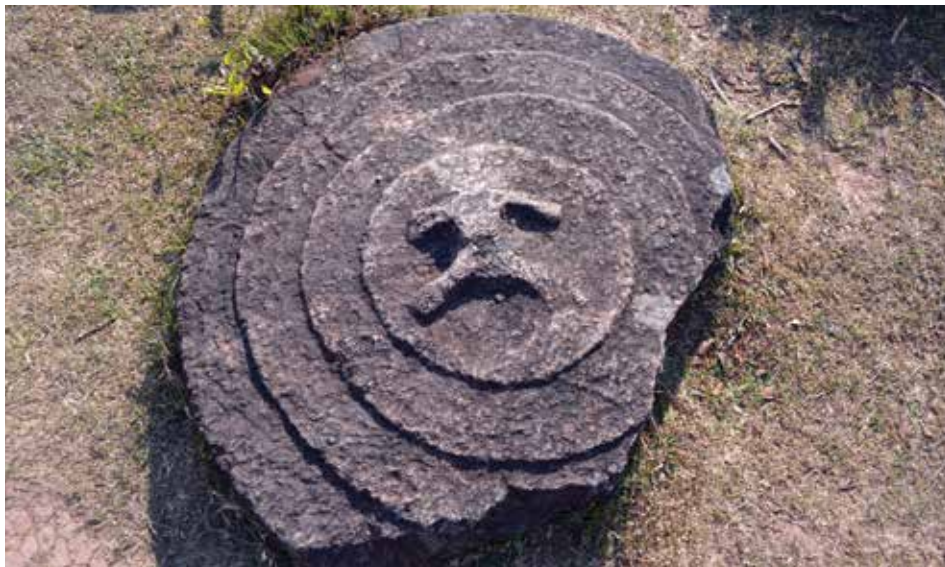
ABOVE The jars at Ban Nakho lie on a hill about 12km from those at Ban Hai Hin. Some of the 15 discs at Ban Nakho feature decorative circles or figures.

unrecorded sites. Of particular interest was the discovery of several sites where the megalithic jars were buried up to their rims. Although buried jars have previously been reported, the new discoveries indicate the practice was more widespread than previously suspected, while also hinting that there may be further sites that are still unknown, even to locals.