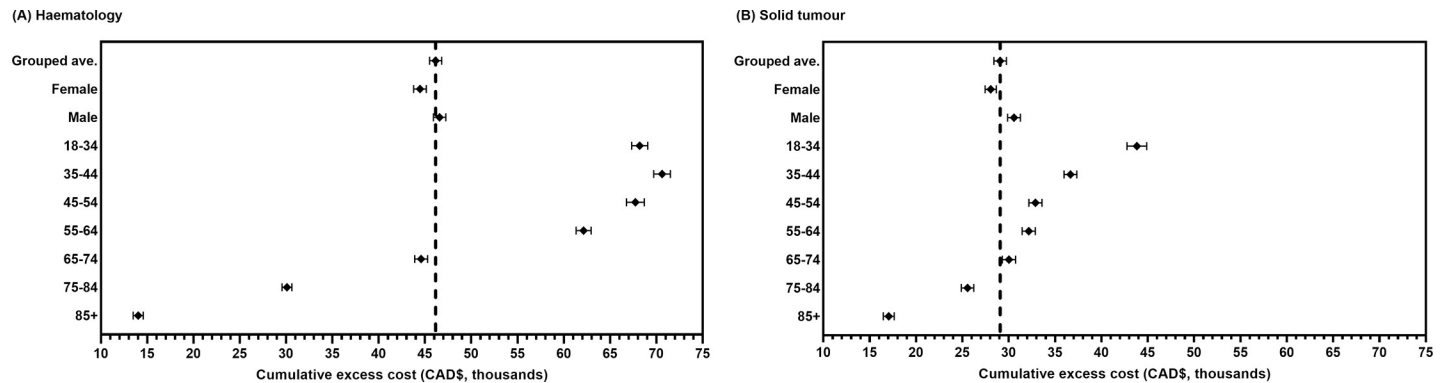
Fig 2. Variations in the 1-year cumulative excess cost by sex and age groups. (A) Haematology. (B) Solid tumour. The dotted vertical line represents the excess cost presented in our main analysis (overall grouped average). Error bars represent the 95% confidence intervals.

https://doi.org/10.1371/journal.pone.0255107.g002