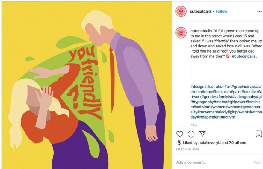
Figure 6: Cutecatcalls