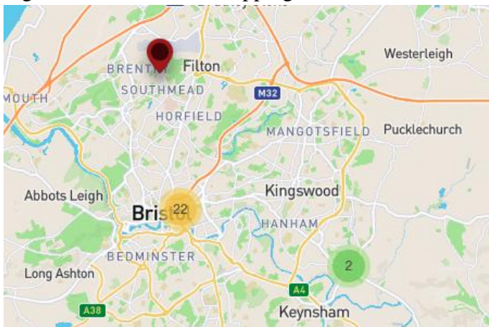
Figure 2: BSHP online mapping