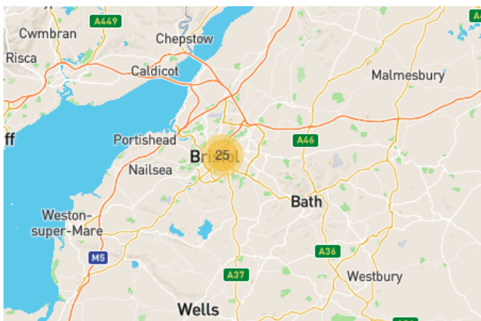
Figure 1: BSHP online mapping

harassment on an interactive Mapbox map, either directly on the website or via an app. Users are able to create a data point by dropping a pin on the map at a precise location, and entering a text-based description of what happened. Different levels of visualisation are provided by zooming in and out of the map. A 'zoomed out' view presents a quantification of incidents, with individual incidents across a location collapsed into a single circle with a number indicating the total number of mapped experiences. By zooming in, the viewer receives an increasingly granular visualisation of incidents in localised areas, with numbered circles gradually breaking up into smaller numbered circles, and then individual incident pins (see Figures 1-3). By hovering over dropped pins, viewers are able to read a qualitative account of what happened at each documented location. Thus, the BSHP platform affordances allow for several modes of visualisation, from the more traditional quantification of incidents, through to written accounts of lived experiences.