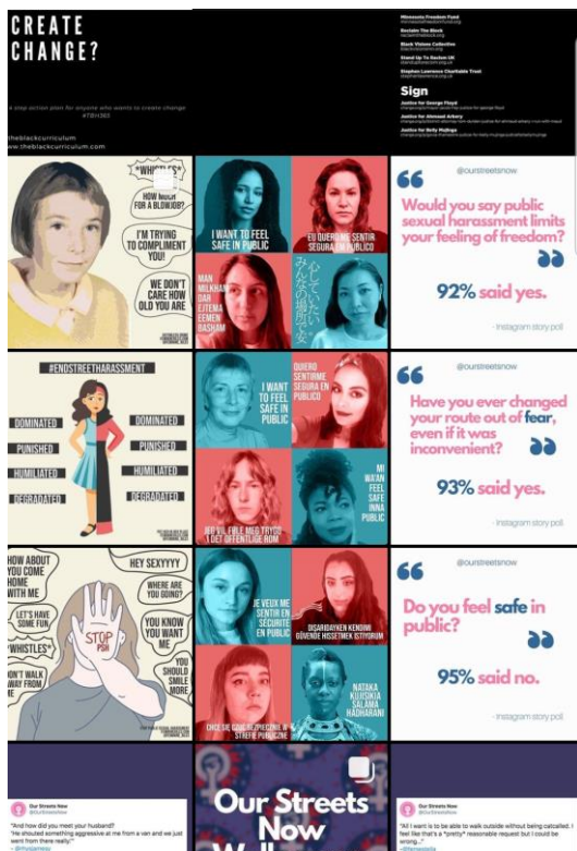
Figure 7: Ourstreetsnow

In the case of Ourstreetsnow, posts that included statistics were strategically curated within the gallery overview of the Instagram account to sit alongside posts that incorporated quotes, photos, and artwork that articulated and conveyed a plurality of voices and experiences of street harassment. The juxtapositioning of statistics, which are often presented as a percentage or a number alongside text that is pasted over a plain coloured background or at times embedded within an illustration, alongside other artwork, portraits and quotes helps to contextualise the numeric data and reattach it to women’s voices and experiences. In this way, the Ourstreetsnow’s approach to visualising street harassment blends and splices together a range of visualisation tactics that attempt to reconcile different epistemological stances to appeal to a broader audience.