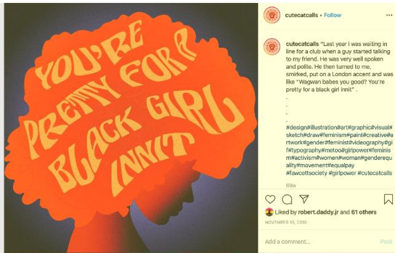
Figure 5: Cutecatcalls

these words embedded in her hair, as she is turned away in darkness (Figure 4). Her hanging head cast in shadow as a red light shines onto her hair representing the burn of humiliation inflicted by such a male intrusion. The ‘precise’ value of this experience is unlikely to be captured in simplified statistics representing it as ‘verbal harassment’, or perhaps ‘racist harassment’ (missing the ways in which it is simultaneously racist and sexist).