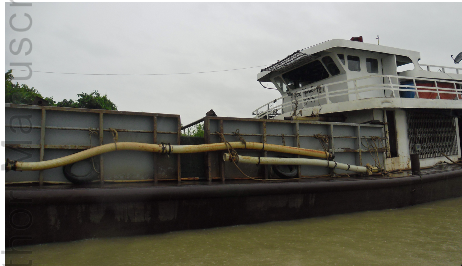
APV_12256_Figure 4 Sand boat Radford and Lamb.tif