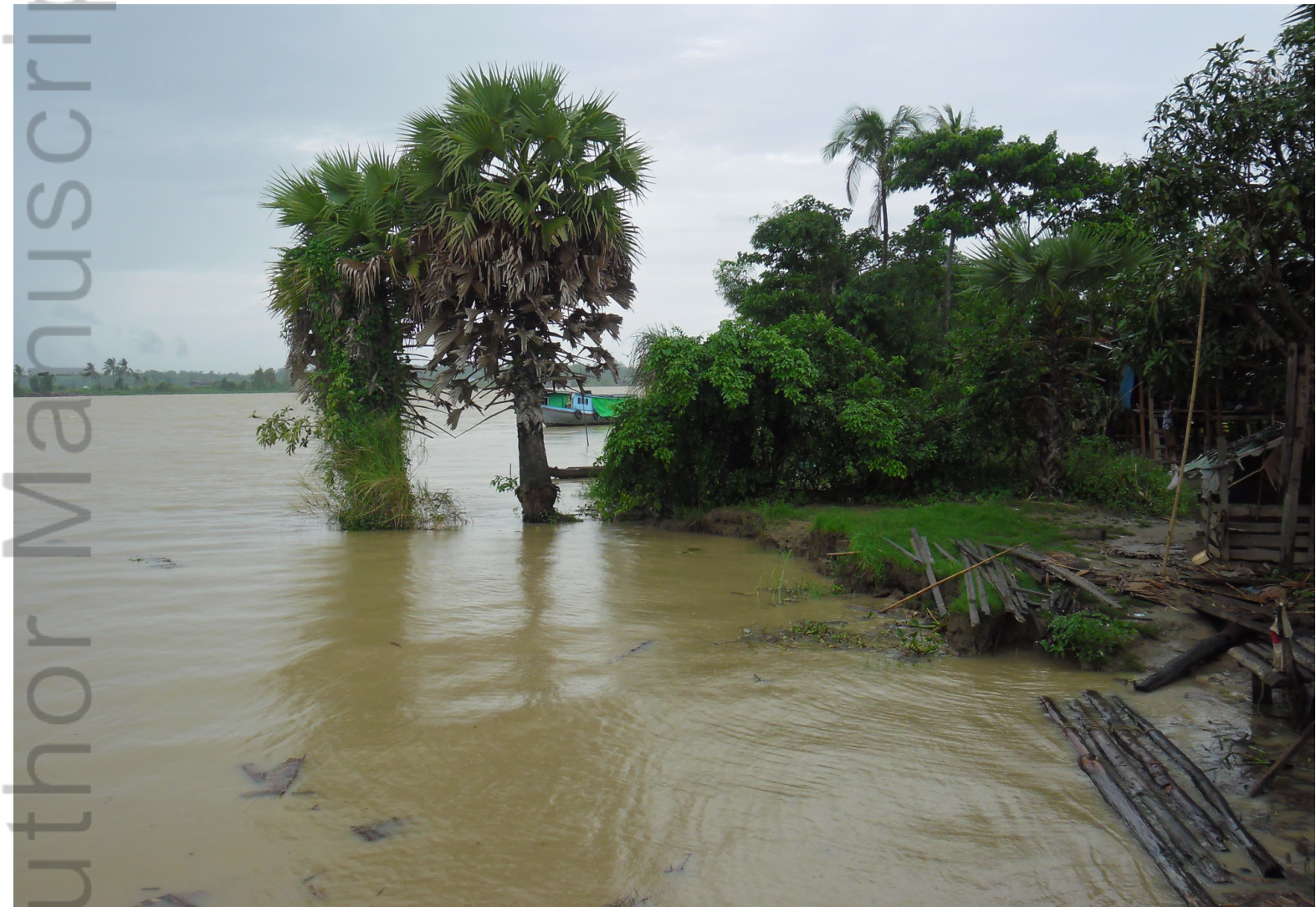
APV_12256_Figure 3 Riverbank change Radford and Lamb.tif