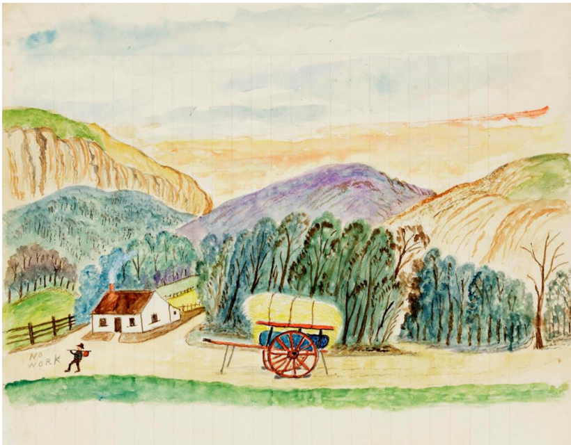
Figure 5: Henry Dearing, No Work c. 1935, watercolor, gouache, and pencil on paper, 20 × 25 cm

experience of unemployment ( No Work ), the hazards of working in the bush ( Jim don't Get Cross ) and the arduous experience of rural labor ( Jim You Got Three Miles to Goe ), as well as the frugal living conditions of itinerant laborers ( Washing Day in Camp ).