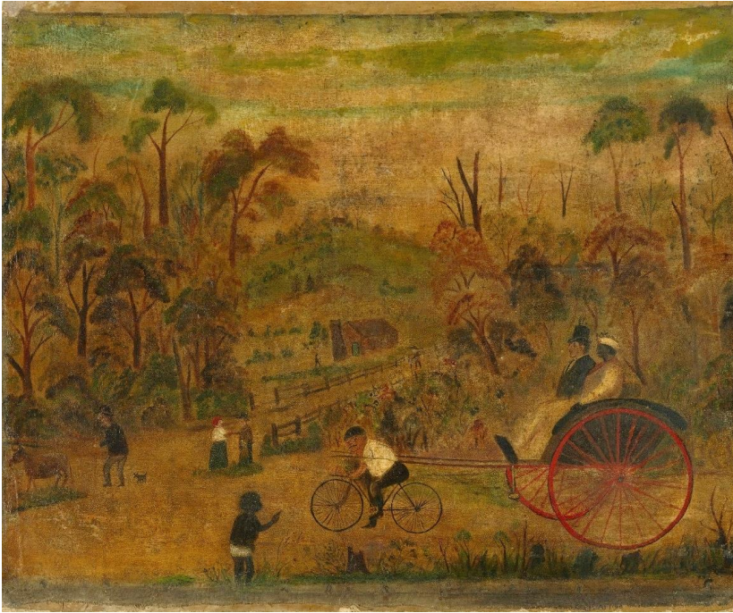
Figure 3: Henry Dearing, A Country Drive with Foreign Friends: A Bicycle-Drawn Sulky c. 1925, oil on canvas on cardboard, 63 × 76.5 cm