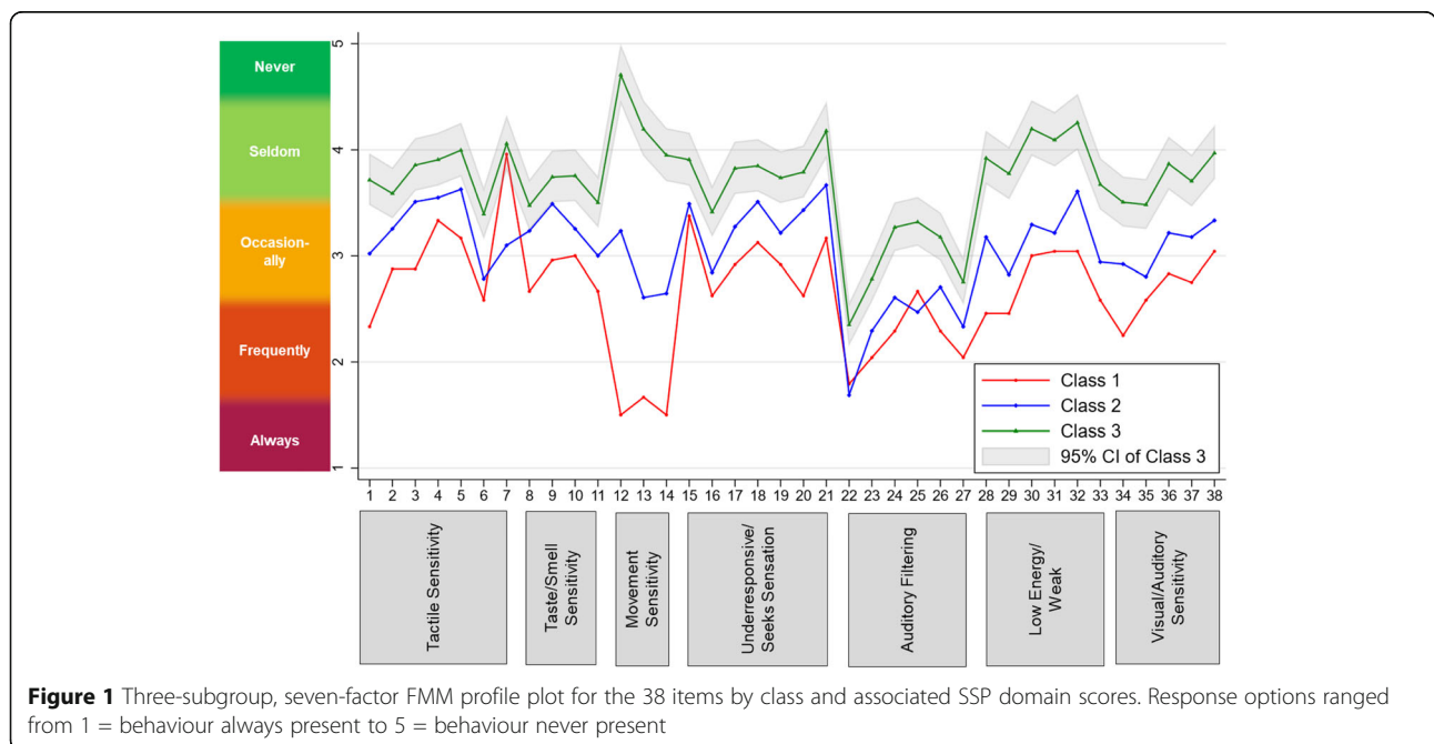
Figure 1 Three-subgroup, seven-factor FMM profile plot for the 38 items by class and associated SSP domain scores. Response options ranged from 1 = behaviour always present to 5 = behaviour never present