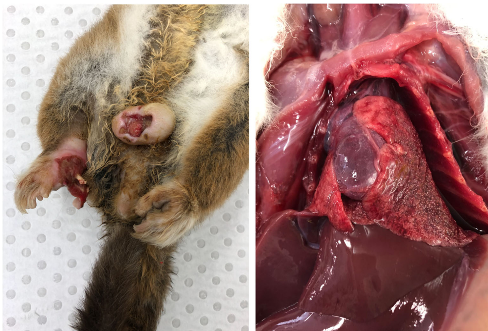
Figure 1. Severe cutaneous and systemic M. ulcerans infection in a male common ringtail possum from Essendon, Victoria (Case 1). Left: Extensive, deep ulcers are visible on the right hind paw, exposing the distal portion of the metacarpal bone of digit 1, and the scrotum. These lesions would likely have been aligned and in contact when the animal was sitting crouched. Right: Lesions presumably interpreted as multifocal pulmonary microgranulomas were observed grossly.

Histological examination of the skin lesions revealed severe ulcerative necrotising pyogranulomatous dermatitis, cellulitis and myositis, with abundant intralesional Gram-positive and acid-fast bacilli on Ziehl–Neelsen (ZN) staining. Severe autolysis and freeze–thaw artefact prevented meaningful histological interpretation of the organ sections, including the lungs.