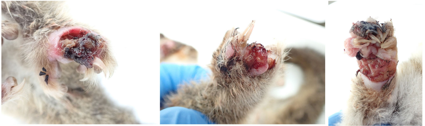
Figure 3. Three of the ulcerative BU lesions observed in a female common ringtail possum from Essendon (Case 3). Left: Dorsal surface of left hind paw with deeply undermined wound edges and tendons and bone visible under the central necrotic plug. Centre: Craniodorsal aspect of right hind paw, showing the exudative ulcerated surface of digit 4 and missing nail. Right: Palmar view of the extensive proliferative ulcerative lesion partially encircling the right fore paw.