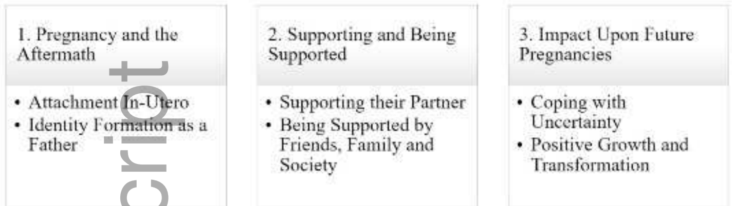
Figure 2. Key Themes and Subthemes