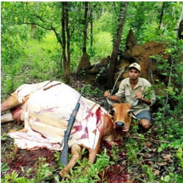
FIGURE 2 Example image of engagement of on-country activities (eg hunting)