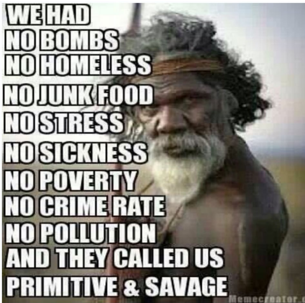
FIGURE 5 Example meme about reflections on the social determinants of health

are evolving at a pace much faster than that of revision processes associated with research ethics guidelines and principles. When adopting content analysis through social media platforms, significant effort must, therefore, be invested in understanding and appreciating the cultural and social context of the population under consideration, and how these contextual factors generate unique social media practices. These ethical issues may become increasingly complicated in situations where voluntary informed consent is sought virtually, rather than in person. This observation also has significant implications for publishing research findings that have used social media platforms to inform data analysis, as some publishers are now also requiring evidence of consent procedures. In our experience, publisher expectations associated with informed consent may well differ to those approved by certified human research ethics committees, which can create additional ethical dilemmas.