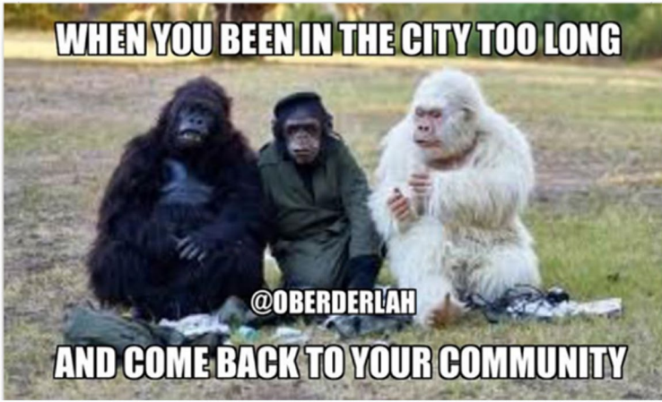
FIGURE 3 Example meme of identify formation