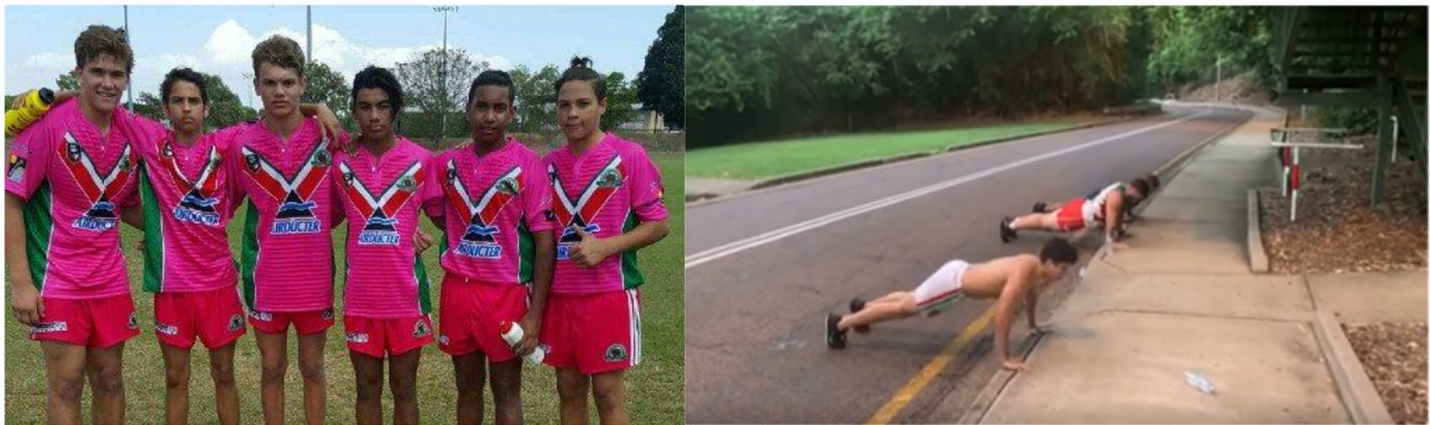
FIGURE 4 Example images of participation in team sports and physical activity