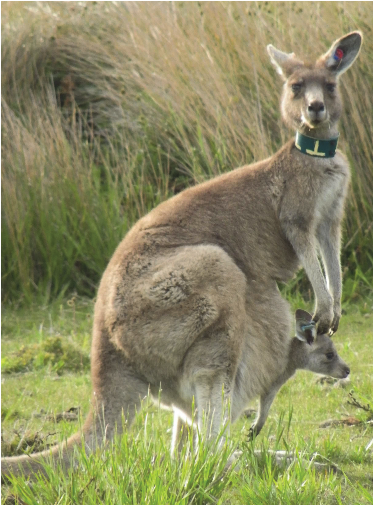
Fig 1. Female #81 with adopted young #531 in her pouch. The light blue eartag in the ear of #531 was applied when captured in the pouch of female #363.