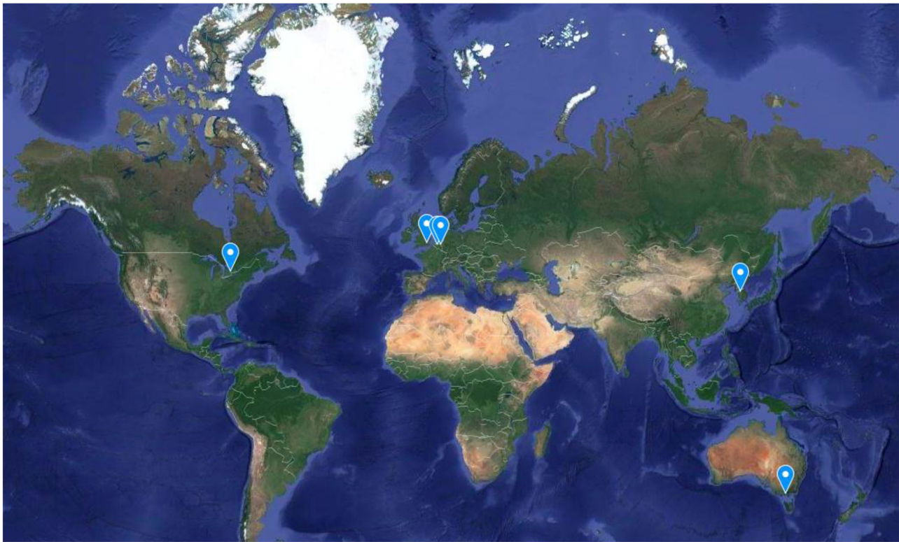
FIGURE 1 | Participating sites.

illness outcome and be further subcategorised. Assuming that ~22% of the CHR-P group will develop psychosis over 2 years (7), this will yield subgroups who do or do not develop psychosis.