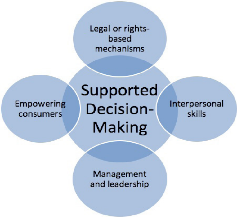
Figure 2. Domains of supported decision-making in mental health service delivery

The following emerged as intersecting mechanisms or domains for supporting supported decision-making in everyday practice and service delivery.