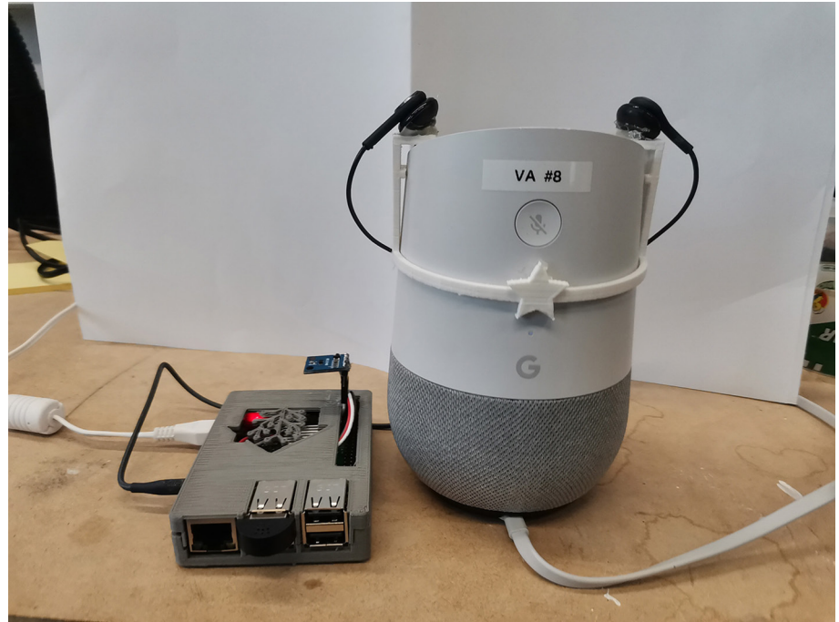
Fig. 1 A proactive Google Home assistant. We attached earphones to the speaker, which deliver inaudible sound bites for activating the device and invoking custom applications, such as triggering a health survey or invoking a medication reminder.