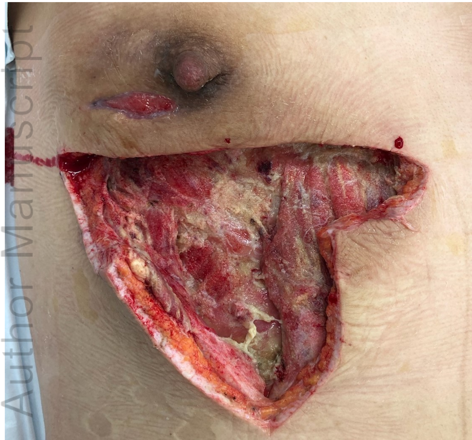
ANS_16678_Case study photo2.jpg