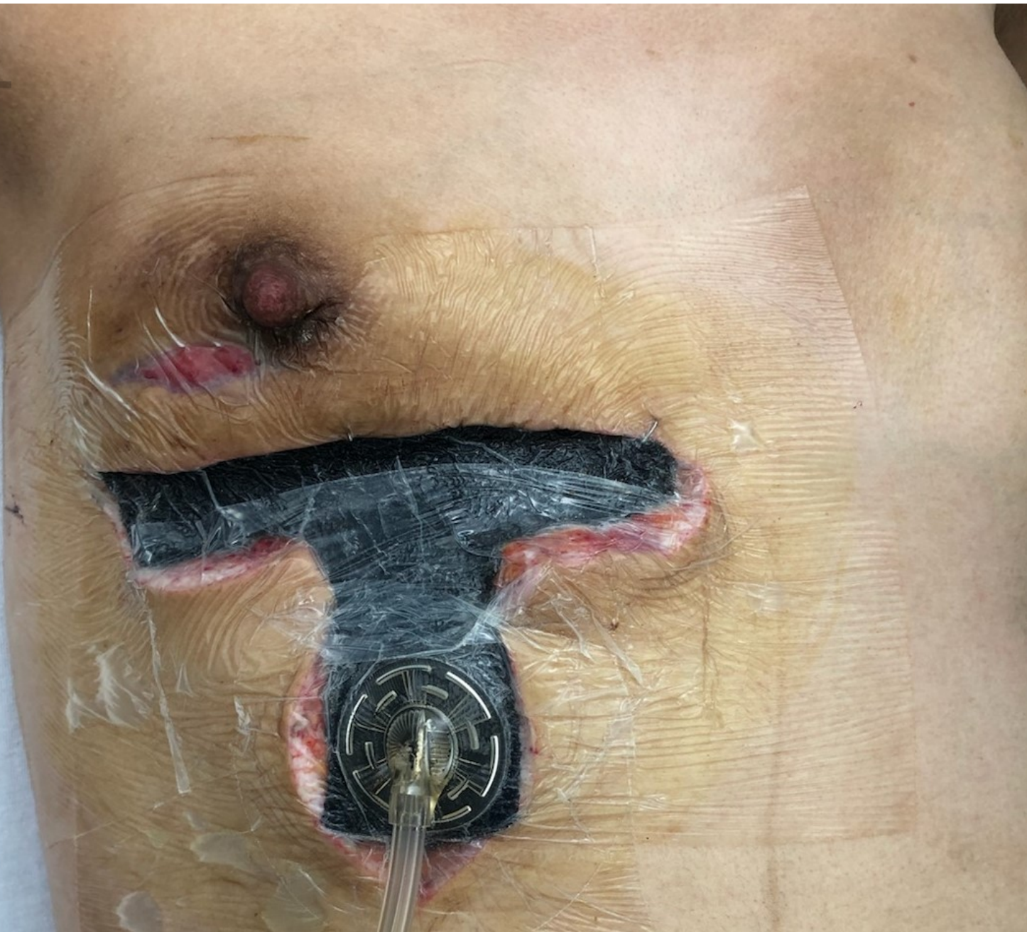
ANS_16678_Case study photo3.jpg