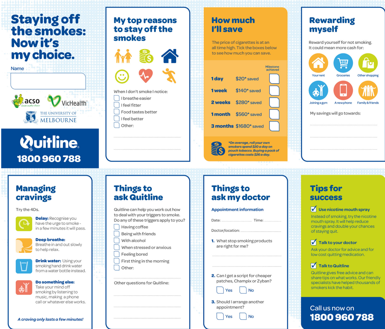
Figure 2 Personalised, interactive self-help pocket guide.

caseworker will ask the participant if they have accessed primary care since release from prison, and if not, they will provide a further referral to the GP.