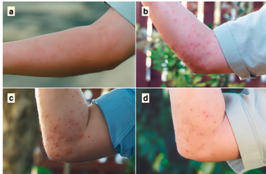
Figure 2. Pseudo pustule clinical progression of red imported fire ant stings (hallmark sign). (a) Five minutes after the event, showing raised welts at sting sites; (b) 18 h after, showing typical pustules; (c) 48 h after; and (d) seven days after the event (Solley et al. 2002) [37].