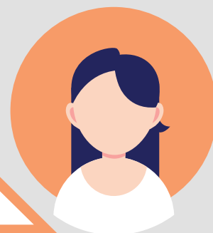
Brooke, 30, side-hustle as a gardener

My equipment, apparel like footwear, and gloves, mower, maybe some spray, trimmer, leaf blower, rake, those things were just my investment initially... I did have some savings but at the same time, like I could feel comfortable maybe a little investment at a time, so it wasn't all at once. I didn't purchase all of the equipment at once. There was couple of jobs that I completed with just the limited equipment supply and then saved up to purchase more.