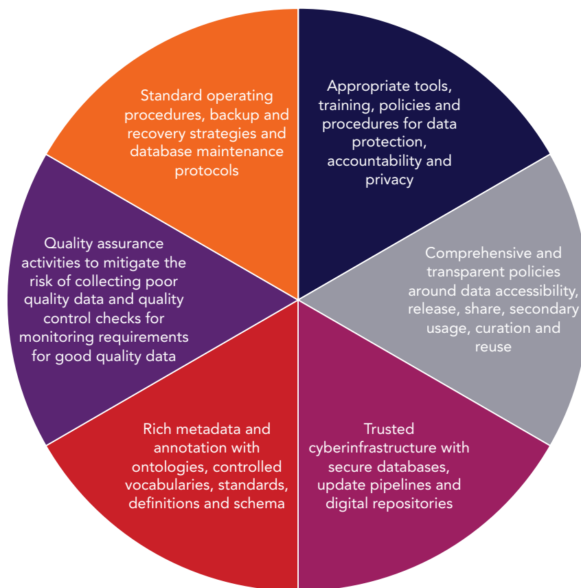
Figure 1. Data Stewardship Practices for Data Management and Analytics

sharing data for informing response during an infectious disease emergency.