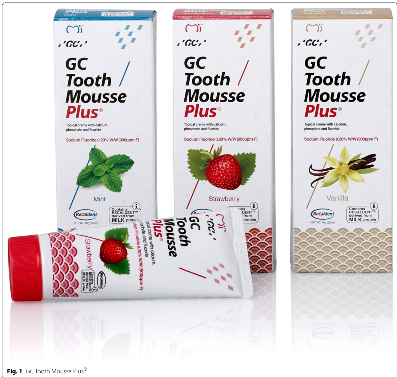
Fig. 1 GC Tooth Mousse Plus®