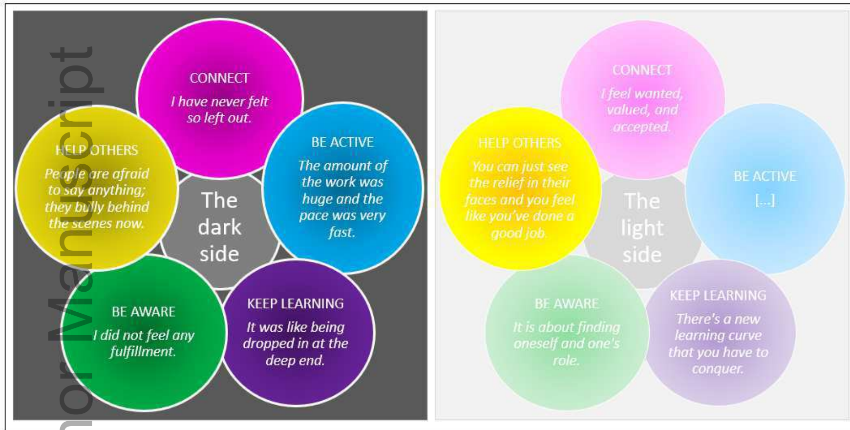
Figure 3. Graduate nurses' voices and the 5-ways to well-being model.

Note. This model is adapted from the New Economic Foundation's (Aked et al., 2008) 5-ways to well-being model. The quotes in the model are presented in italics and references for these quotes can be found in Table 3.