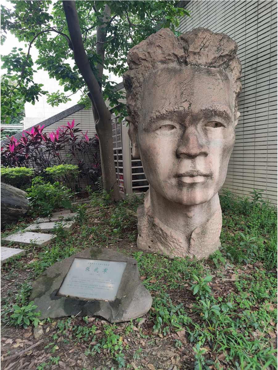
Figure 2. Bust of Zhang Wojun, Banqiao Elementary School. Sculpted by Yang Chun-Sen 楊春森.

undoubtedly promoted such ideas on both sides of the Taiwan Strait. His role in the development of Taiwan's contemporary intellectual thought is palpable, yet he has all but disappeared from public memory.