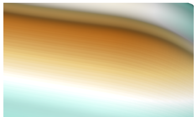
Figure 4. A KDE-interpolated surface using a large maximum distance.

The points themselves are written in a GeoJSON for visualization, and the surface is written as an ESRI ASCII Grid. The visualizations in this paper were all done using QGIS (QGIS, 2022) and its QGIS2ThreeJs plugin (Akagi, 2022) for 3D rendering. These include the visualization of the top-5 terms of each topic as labels draped on the surface. The color scale used is single-band pseudo-color, with five linear interpolated classes (from lower to higher values: dark green, green, white, light brown, dark brown)