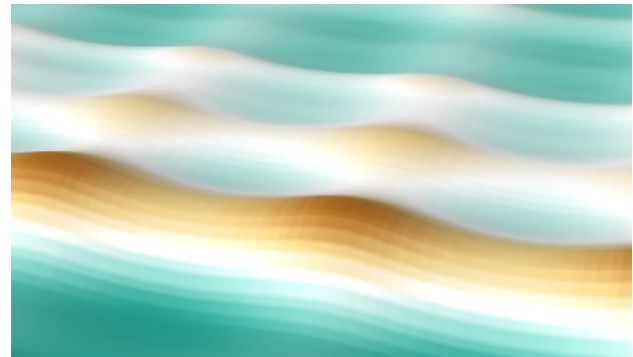
Figure 3. A KDE-interpolated surface using a small maximum distance.

one time interval, the surface starts to appear "corrugated" (Figure 3), while a larger value gives more uniform results (Figure 4), which may hide local "dips" or "peaks" in topic popularity. In addition, larger maximum distance values bring higher Z values, which can be countered by re-scaling the output surface.