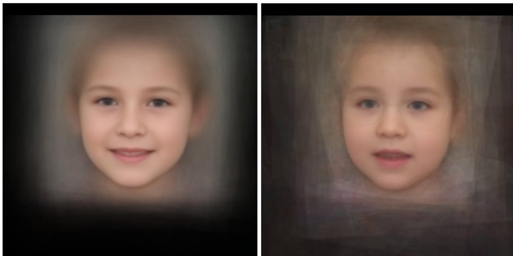
Figure 3 Computational analysis of photographs of PURA (purine-rich element binding protein A) syndrome individuals. Result of an objective computational analysis on photographs of 34 individuals with PURA mutations (ages at photographs ranging from 2 months to 19 years; right image) compared with the average image based on 301 age-matched, healthy controls (left image). The computational modelled PURA face showed a hypotonic face with typically open mouth appearance and full cheeks. Additionally, two independent dysmorphologists reported a slightly abnormal shape of the eyes as (1) shorter palpebral fissures and (2) eversion of lower lateral eyelids. The high anterior hairline observed in a subset of individuals is not visible on this computational model of the PURA face.

stereotypic hand movements and excessive hiccups in utero have not been reported in literature before. Using the summarised clinical information (online supplementary table 2), we calculated the frequency of clinical features in all 54 individuals (table 1).