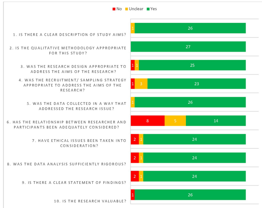
Fig 2. Summary of critical appraisal assessments.

https://doi.org/10.1371/journal.pone.0225441.g002