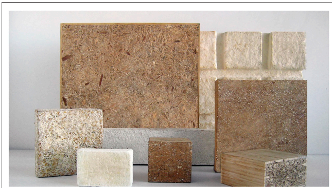
FIGURE 2 | Various mycelium-based panel product samples.

2014a, 2014b, 2015, 2016, 2017a, 2017b, 2018) and Mohammed Islam et al. (2017). They found mycelium boards performed well enough on stability, strength and thermal insulation to compete with other comparable products on the market, which seemed to indicate that the products would be viable for use in the building industry. But from a business perspective, bio-based building materials could not compete with traditional materials based on cost-effectiveness Figure 2 .