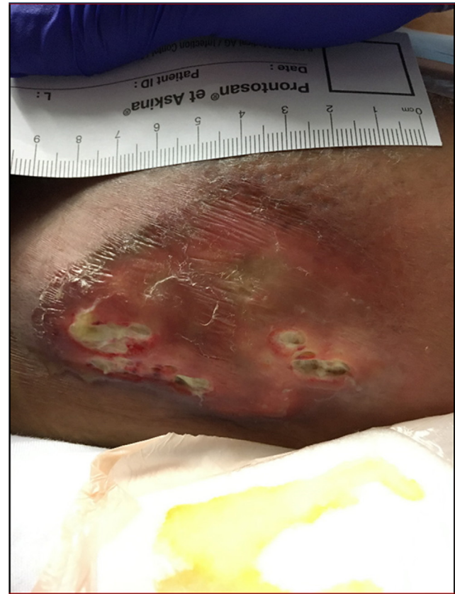
Figure 2 Cutaneous cryptococcosis with ulcerated pustular lesions.