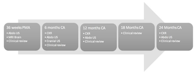
Figure 3 Planned surveillance for tumour formation. Abdo US, abdominal ultrasound; CA, corrected age; CXR, chest X-ray; PMA, postmenstrual age.

In addition to routine care, infants will also receive fortnightly liver and renal function tests until discharge to assess for signs of organ damage related to allogeneic rejection, and imaging (abdominal ultrasound and MRI brain) at 36 weeks' PMA to term to assess for tumour formation.