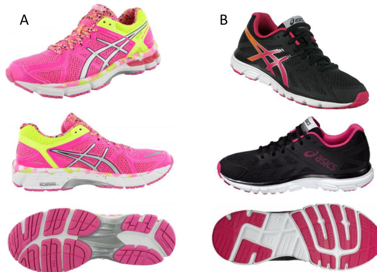
Fig. 1 The high-support shoes (ASICS Kayano-GS, a ) featured a medial post, < 10^\circ torsional stiffness, < 10^\circ heel counter stiffness and < 45^\circ midfoot longitudinal stability. In contrast, the low-supportive shoes (ASICS Zaraca 3, b ) featured a uniform midsole density, 10\text{--}45^\circ torsional stiffness, 10\text{--}45^\circ heel counter stiffness and > 45^\circ midfoot longitudinal stability

single limb drop lateral jump (DLJ, Fig. 2). For each participant, jump height was scaled to a relative box height of 30% of their lower limb length, measured from the outermost lateral aspect of the greater trochanter to the floor. We normalized box height to individual limb anthropometry, to create similar neuromuscular demand between participants, as an individual's jump/landing height increases during adolescent years [36].