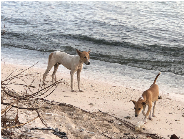
Figure 1. Living conditions of dogs on Tarawa Atoll, Kiribati.

led by the Mardi Chi Dingo Foundation ( https://fariervet.com/mardi-chi ; Figure 1), which aims to seek a sustainable locally driven solution to improving animal health and overpopulation problems. The protocol of this study was approved by the Animal Ethics Committee at the Faculty of Veterinary and Agricultural Sciences (University of Melbourne, Melbourne, Victoria, Australia; ethics identification no. 1914930).