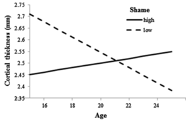
Fig. 3. Association between age and left IOFC thickness for high (+1 SD) and low (-1 SD) levels of shame-proneness.

At an uncorrected level, there was a significant association between higher levels of guilt and thicker right dmPFC ( \beta = 0.33,