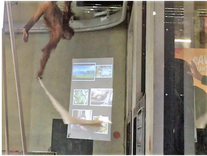
Figure 1: Juvenile female uses a sack to swipe at the Photos application

We adopted a user-centered design (UCD) process to explore how animal-computer interaction (ACI) methods could contribute to the design of digital cognitive enrichment in the context of the zoo. Work like this in ACI seeks to explore how technology can be utilized to reconfigure human-animal relationships “by allowing the animals’ individual ‘voice’ to emerge” in the design process, as well as through use of the resulting technology (Mancini, Harris, Aengenheister & Guest, 2015). We argue that UCD is an extremely appropriate design methodology for the Zoo, as UCD acknowledges that all design is embedded within wide social contexts, and there are a multitude of potential ‘users’, or beneficiaries, of a technology in the Zoo (such as visitors, zoo-keepers and animals). Our approach encompassed observations and interviews of visitors and keepers, along with extensive observations of the orangutans (drawing on Nippert-Eng (2015)), and design workshops with representatives of the different social contexts in the zoo. We developed 5 applications that were used in the study reported here: Burst , Sweep , Gallery , Painting and Match (described in Table 3). None of these applications involved food-rewards, and interactions with the system were not enticed or encouraged via food.