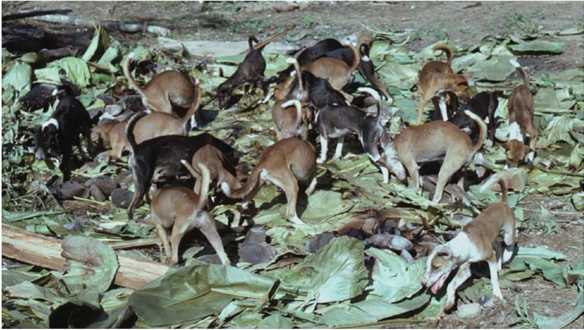
Fig. 3: Dogs rummaging in the debris left behind after cooked food, including pig, has been removed from an oven. Photograph taken at Gwaimasi in 1987, P. D. Dwyer.